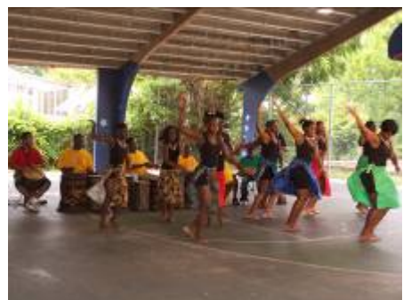
Djole Dance and Drumming Company

This project is unique in that not only are we impacting the lives of orphaned or vulnerable children in Ghana but we are also providing volunteer, educational and mission work opportunities for the inner-city children in our local community. We are also offering valuable volunteer opportunities for individuals and professionals who are interested in making a difference locally and globally.