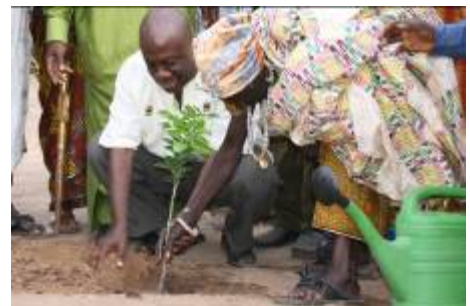
Groundbreaking for the Centre in Ghana