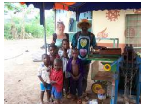
Cindy and Powerful (co-directors) with brick-making machine and local village children