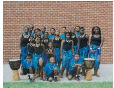
Djole Dance and Drumming Company

Project OKURASE's roots are closely tied to North Charleston through the children and supporters of Djole Dance Company, a West African dance and drumming group based out of North Charleston's Union Heights community and sponsored by the Gethsemani Circle of Friends. During the summer of 2006, the children embarked on a trip to Ghana and came home with a mission.