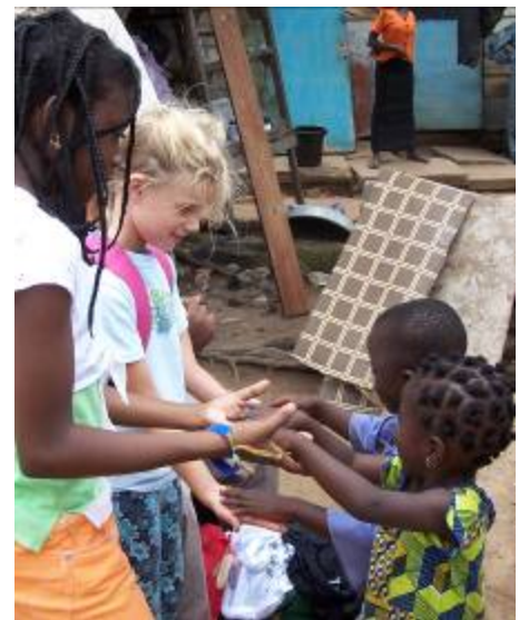
Our children playing with the children of Ghana

As a result of Djole's trip, Project OKURASE is building an arts-based center bordering the village of Okurase. The center will consist of 16 buildings which will include a school, a performing arts center, a clinic, an art studio, housing for orphaned children, and much more. Ground-breaking for the complex took place in March 2008 and the money raised from the music festival will be earmarked for a sustainable, clean water treatment system for the center. The goal of Project OKURASE is to develop a model that can be replicated around the world with the central focus being on green design, sustainable architecture, job and skills training, family and village-based formal education, and a family-based model for caring for children impacted by HIV/AIDS.