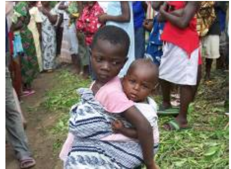
Orphaned children in Ghana